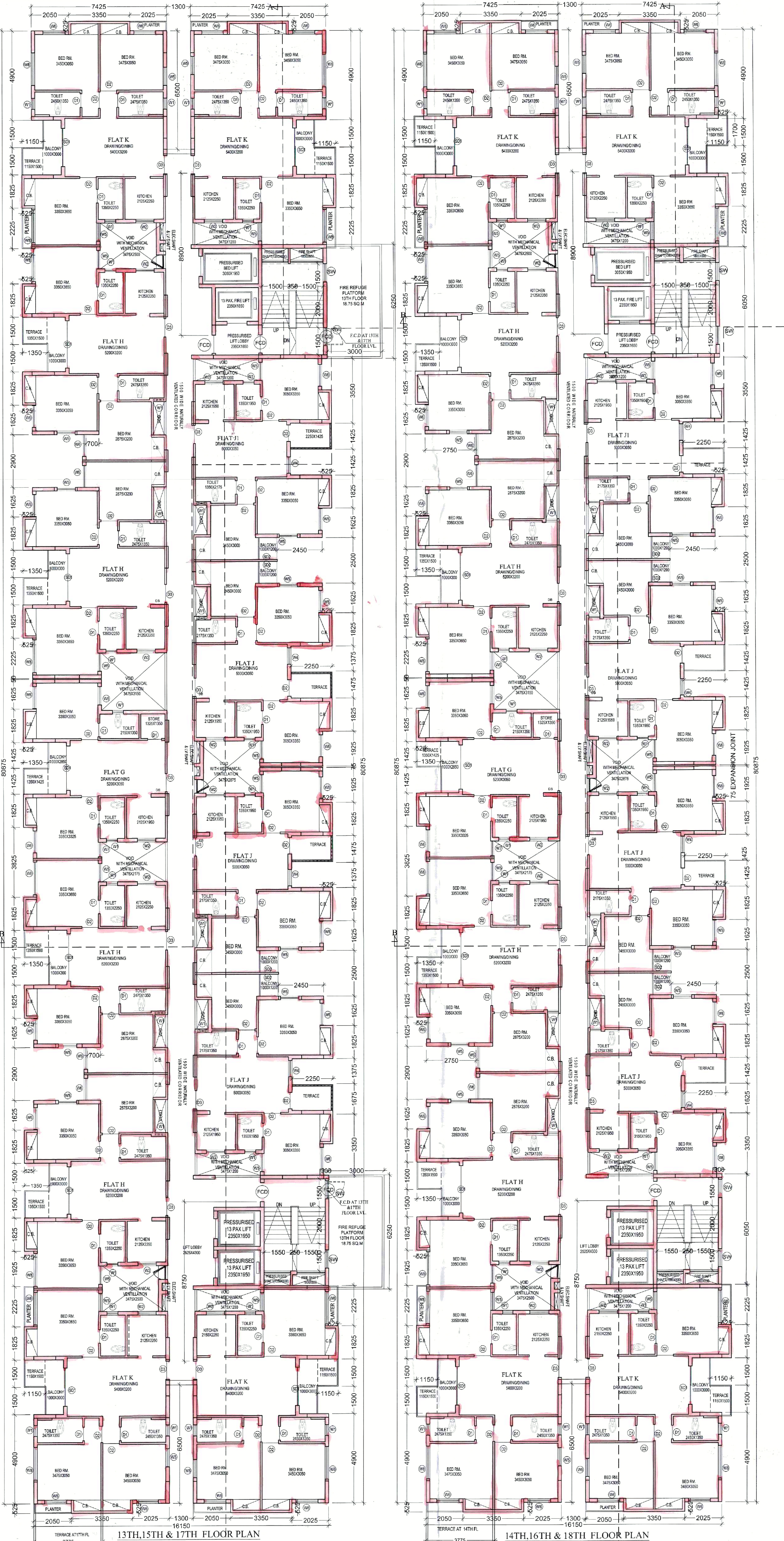
13TH,15TH & 17TH FLOOR PLAN